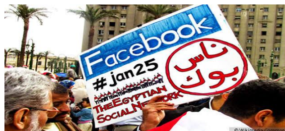
3. Figure : Egypt Solidarity Society

In the context of the Arab Spring in Tunisia, the events spread of protests from one area to another, due to three main factors, namely uploading video demonstrations first in Sidi Bouzid on December 17, 2010 on the social networking site facebook, their sense of solidarity with the people of various circles to participate in the protest, as well as the broadcasting of news by the international mass media, especially Al-Jazeera, the solution can be dijangkaunya information and news for those who are not internet users. (Subkhan, 2011) , Spreading the news carried by Al Jazeera because, according to domestic media does not care about the event.